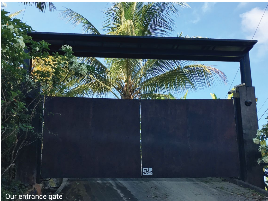
Our entrance gate