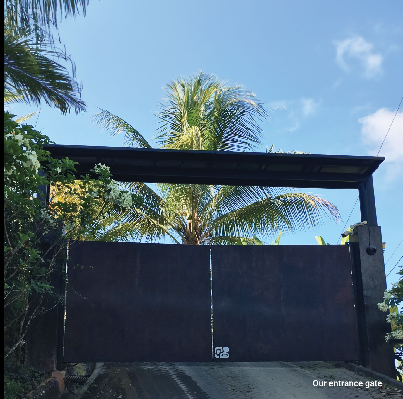
Our entrance gate

As you get close to Uvita give our Front Desk a call or send us a WhatsApp message at +(506) 8521-3407 to let us know your arrival time. We can then either send a 4x4 vehicle to pick you up or prepare for your arrival at the hotel.